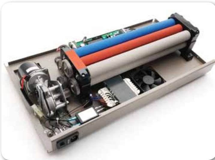
6-roller engine with large diameter rollers (4 hot rollers & 2 cold)

Unique low friction laminating offers jam free performance with Fellowes branded pouches