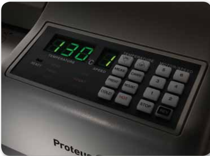
Advanced control panel for flexibility and ease of use