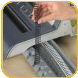
Patented wire & document measure allows user to select quickly