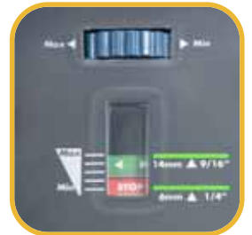
Preselectable closure control for easy wire closure - ideal for binding multiple documents