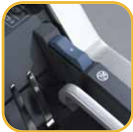
Electric punching for ultimate ease of use