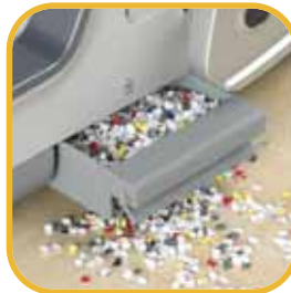
Chip tray with burst out feature to eliminate jams