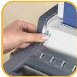
Adjustable edge guide aligns sheets accurately